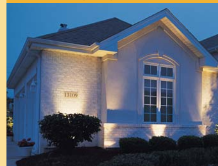
Adds a dramatic effect when lights are projected onto a vertical surface from directly behind an interesting object or plant.