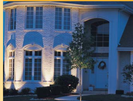
Strategically placed fixtures that focus light upwards, dramatically highlighting buildings, trees or shrubs.