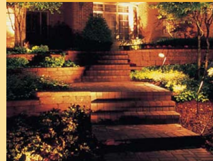
Casts a symmetrical light pattern at a low level to show visitors where to walk. It also highlights plants and shrubberies along the way.