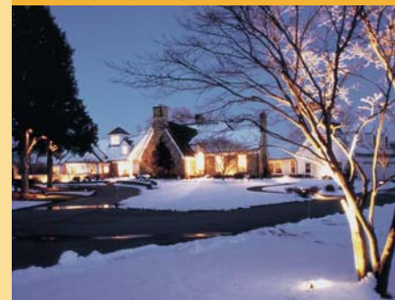
Spotlights and floodlights placed at key locations to deter intruders and add dramatic depth to your property.