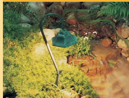
For illuminating ground cover and low shrubberies. Spread lighting highlights areas of interest, and brings out dazzling colours at night for a stunning effect.